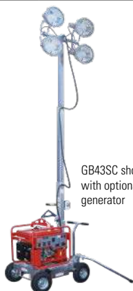
GB43SC shown with optional generator