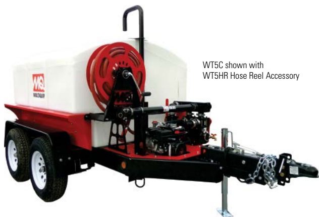
WT5C shown with WT5HR Hose Reel Accessory