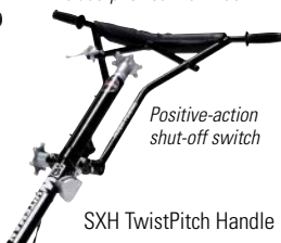
Positive-action shut-off switch