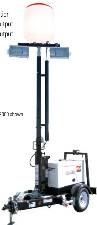
MLTSDW7 w/GB2000 shown