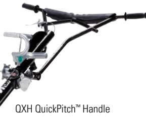
QXH QuickPitch™ Handle