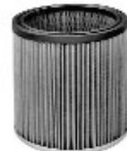
Wet/Dry Pickup Cartridge Filter