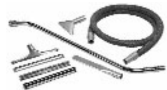
Wet/Dry Cleaning Kit