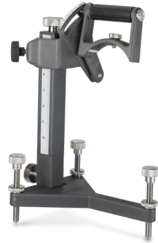
Trivet Stand with Adjustable Pole Trivet Stand