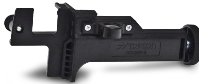
Sensor Holder 6 for LS-80 Series Holder 6