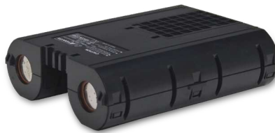
Rechargeable Battery for RL-SV1S and RL-SV2S BT-74Q