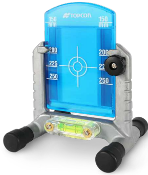
Adjustable Target Kit TP-L5 / L6