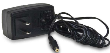
Battery Charger for RL-SV1S and RL-SV2S AD-15 (US)