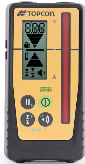
LS-100D Display readout on front and back.