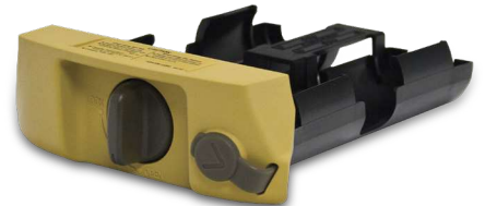
Rechargeable Battery Holder for RL-SV1S and RL-SV2S DB-74C