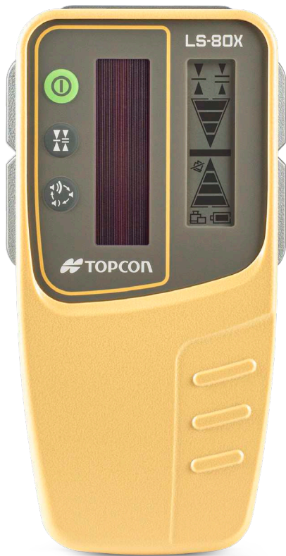
LS-80X Display readout on front and back.