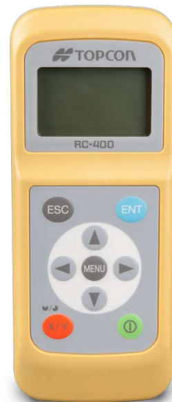
Remote Control for RL-200 2S RC-400