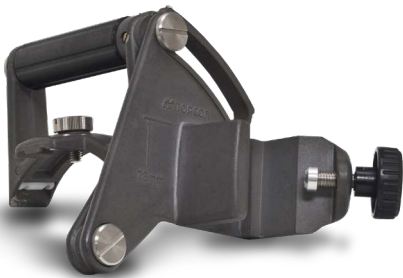
Trivet Handle for TP-L5 / L6 Trivet Stand